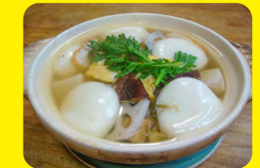
Shimabara's zoni soup is famously hearty. Guzoni soup is said to have begun during the Shimabara-Amakusa Rebellion, when people combined mochi with ingredients from both mountain and sea.