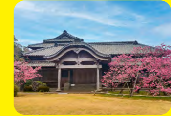
A residence built on the former headquarters site of the Nabeshima clan, lords of the Kojiro domain of Saga during the Edo period, in Kunimi, Unzen City. In 2007, it was designated a National Important Cultural Property.