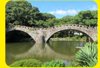
One of Japan's largest stepped, stone double-arch bridges, built in the Edo period. It was the first stone bridge in Japan to be designated an Important Cultural Property.