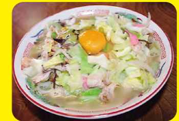
Said to be one of Japan's three great champon styles. Packed with seafood and vegetables, with an optional egg topping.