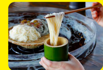
Shimabara produces about 30 percent of Japan's hand-stretched somen. It holds its texture well after boiling, with a satisfying texture.