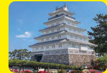
Shimabara-jo Castle was built starting in 1618 by Matsukura Bungo-no-kami Shigemasa, over about seven years. The main keep was reconstructed in 1964.