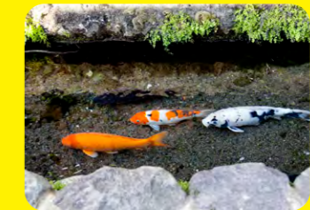
Shimabara City is rich in spring water. In this area, a 100-meter waterway runs through town—hence the nickname, the Town Where the Koi Swim.