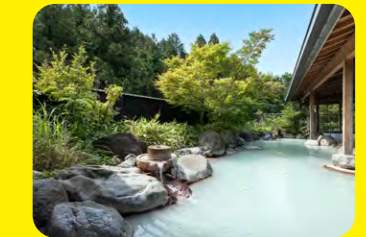
Unzen Onsen is known for its hot springs which have beautifying effects. Every bath is fed directly from the source, and meals featuring seasonal farm and marine specialties of the Shimabara Peninsula are also recommended.