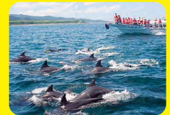
About 200 wild dolphins live year-round in the Hayasaki Strait. You can see them year-round.