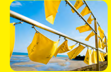
Shimabara Railway's closest station to the sea in Japan. The blue sea, blue sky, and bright yellow handkerchiefs make it a beloved photo spot.