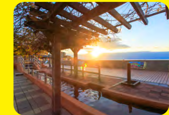
Japan's longest footbath facility, stretching 105 meters, named after Obama Onsen's 105°C source temperature.