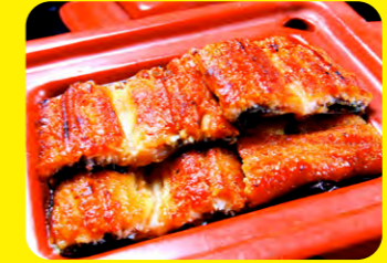
Isahaya's famous eel. Isahaya-style kabayaki is steamed in a double-bottomed Raku-yaki ceramic bowl, creating a wonderfully plump, melt-in-your-mouth texture.