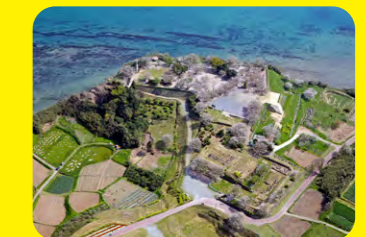
The site of Hara Castle, a key stage of the Shimabara-Amakusa Rebellion. It is one of the component sites of the UNESCO World Cultural Heritage Hidden Christian Sites in the Nagasaki Region.